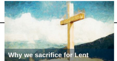
Why we sacrifice for Lent

What we give to these children definitely is a gift for their futures.